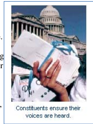
Constituents ensure their voices are heard.

Please visit www.acscan.org and sign up, or see Lynn Vogelpohl for sign up forms. Please do your part to continue the fight against cancer!